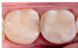
Fig. 2: After: finished fillings after occlusal adjustment