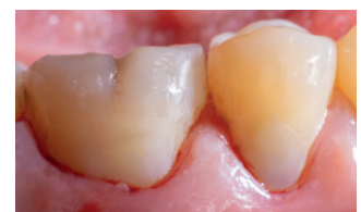
Fig. 4: After: Finished cervical restorations