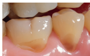
Fig. 3: Before: Exposed cervical dentin at 35 and 36