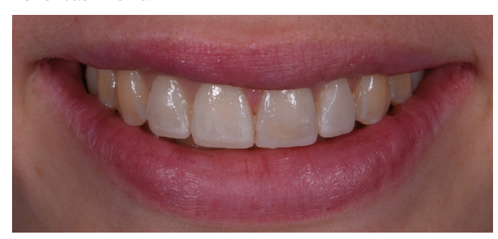
fig. 4, satisfying results