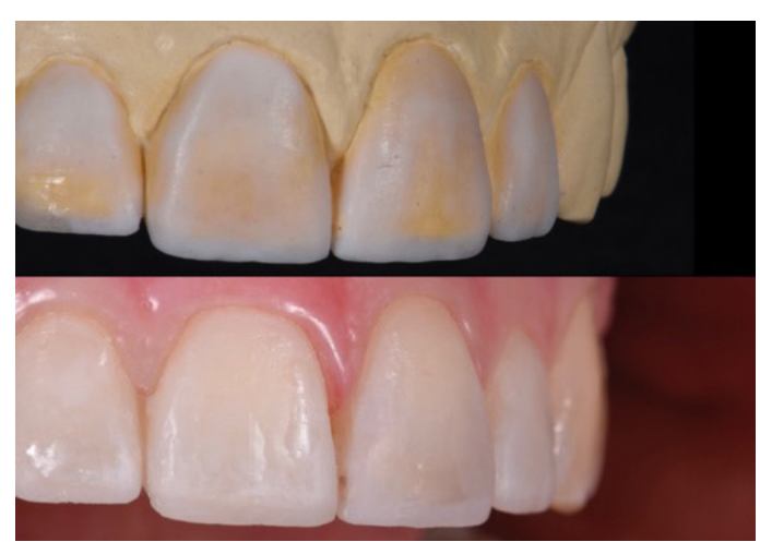
fig. 3, perfect mock-up can be made f.e. with Visalys® Temp, Kettenbach Dental