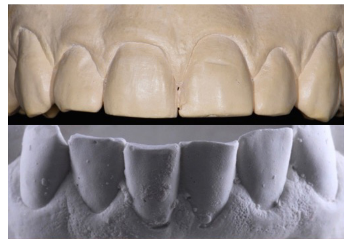
fig. 2, transfere into a precise gypsum work model of the patients mouth