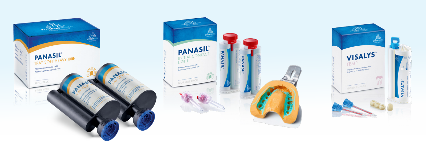
Panasil® precision impression material in different viscosities for best impressions

Therefore, a high-precision impression material such as Panasil® is ideal not only to accurately record our definitive restorations, but also for carrying out the rehabilitation project and, especially, to ensure efficient communication with the patient through the mock-up procedure, thanks to which the patient is able to wear and enjoy his or her new smile early and see what the final outcome will look like even before beginning treatment (fig. 4).