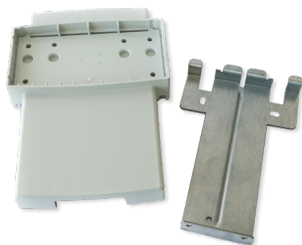
WALL MOUNTING BRACKET